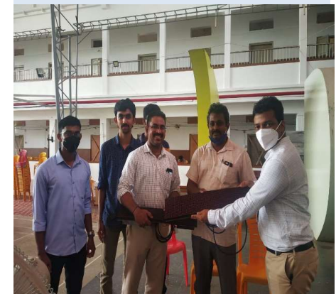
Handing over of digital Token system to Sub- Collector, LA Elections