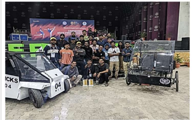
SAE Efficycle 2022